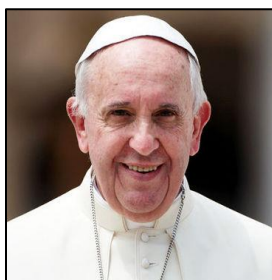
Pope Francis, The Joy of the Gospel

"I dream of a missionary impulse capable of transforming everything, so that the Church's customs, ways of doing things, times, schedules...can be suitably channelled for the evangelisation of today's world rather than for her self-preservation. The renewal of structures demanded by pastoral conversion can only be understood in this light: as part of an effort to make them more mission orientated, to make ordinary pastoral activity on every level more inclusive and open to inspire...a constant desire to go forth."