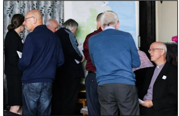
Curious and Curia!